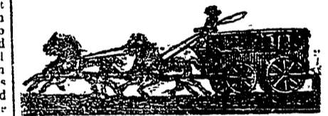
De OMNIBUS rebus et quibusdam alijs.